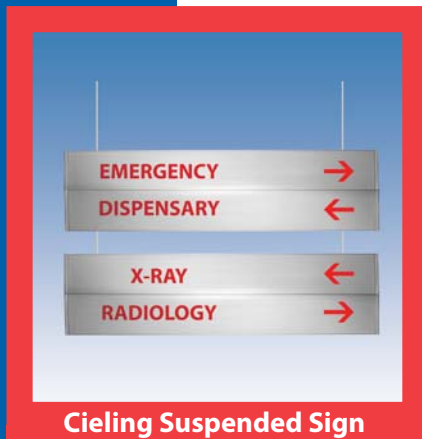
Cieling Suspended Sign