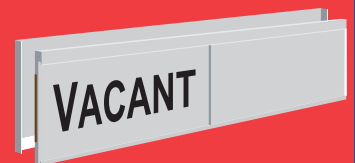
Door Plate with Slider